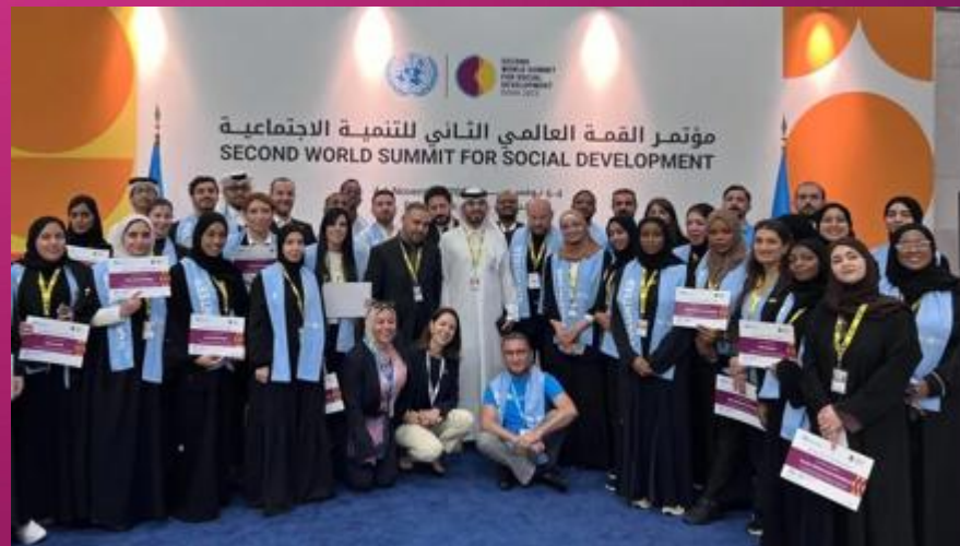
UN volunteers at the Doha UN summit