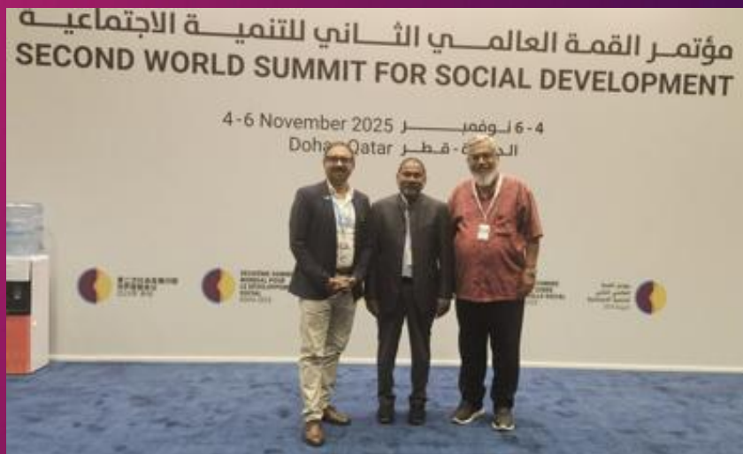
Together with CSO-NGO leaders at Doha conference (2025)